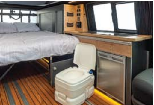
Access to the toilet even with the bed unfolded