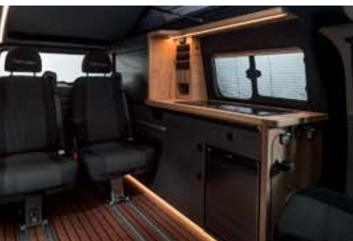
Ambient-style LED lighting