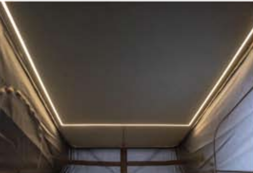
LED lighting in the sleeping roof

*some of the presented features may be available only in selected models or as optional extras