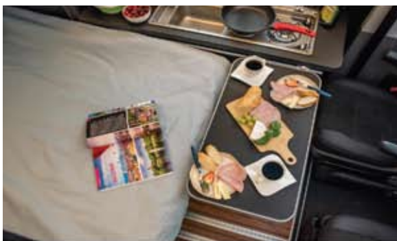
Possibility to use the table with the bed unfolded