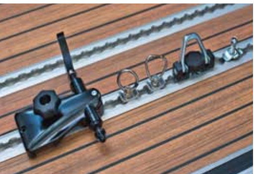
Universal luggage securing system