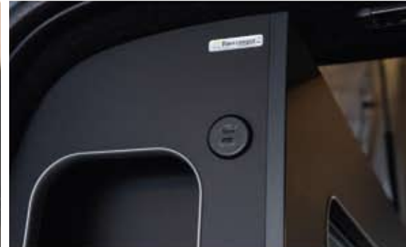
2 x USB-C sockets in the lower bed area