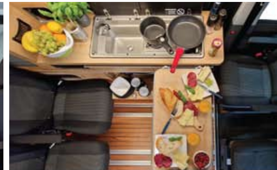
Easy access to kitchen cabinets