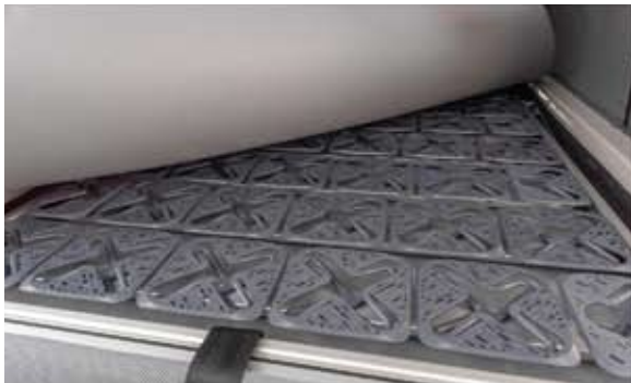
Comfortable roof bed with Froli system