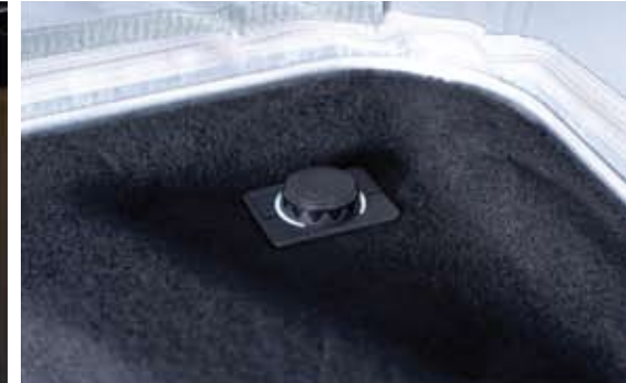
USB sockets in the sleeping roof