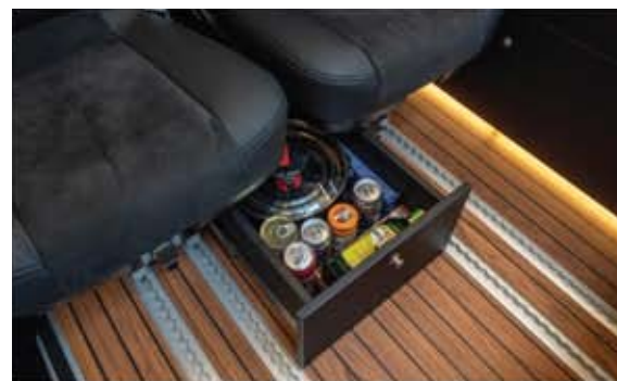
Practical drawer between the seats