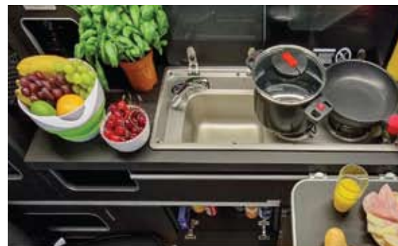
Large countertop space