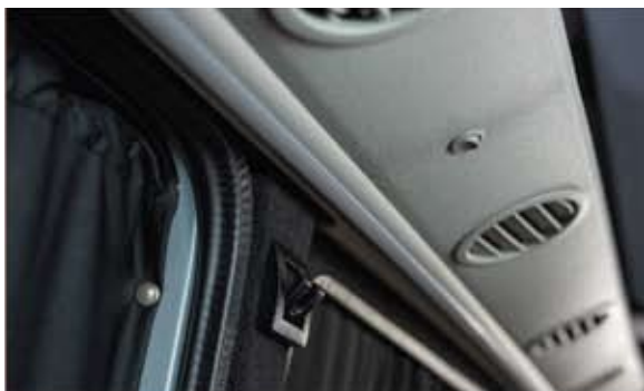
Air conditioning in the living area