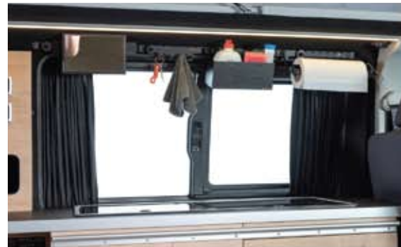
Numerous holders for practical items