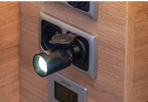
A handy flashlight charged from a 12V socket mounted in an easily accessible holder