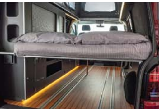
Possibility to use the bed without the seats