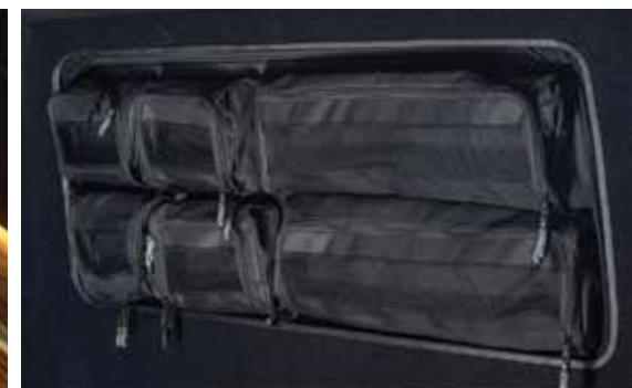
Practical additional bags