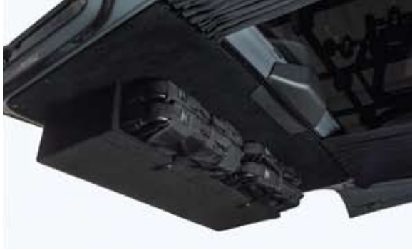
4 foldable chairs in the rear tailgate