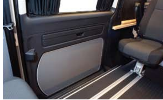
Additional table in the sliding door