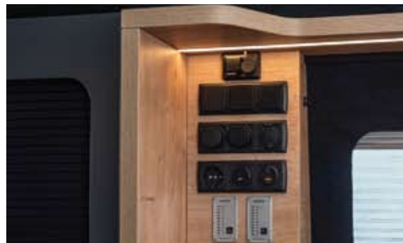
Dual 60W USB-C socket – capable of charging laptops and powering STARLINK