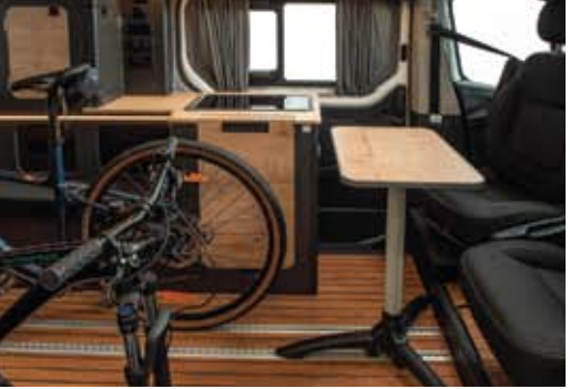
Possibility of using the table with 2 bicycles inside