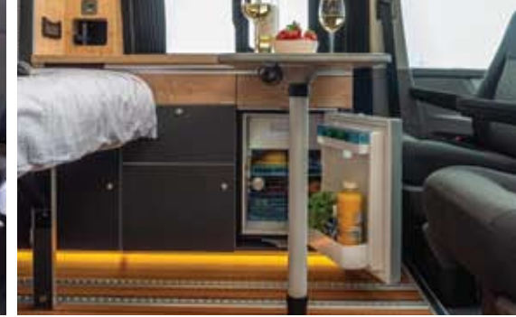
Access to the refrigerator even when the bed and table are unfolded