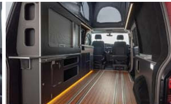
Possibility to remove the lower bed and seats