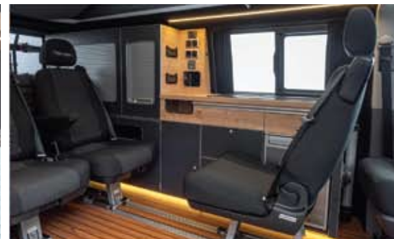
Possibility of using the seats facing backward (opposite to the direction of travel)